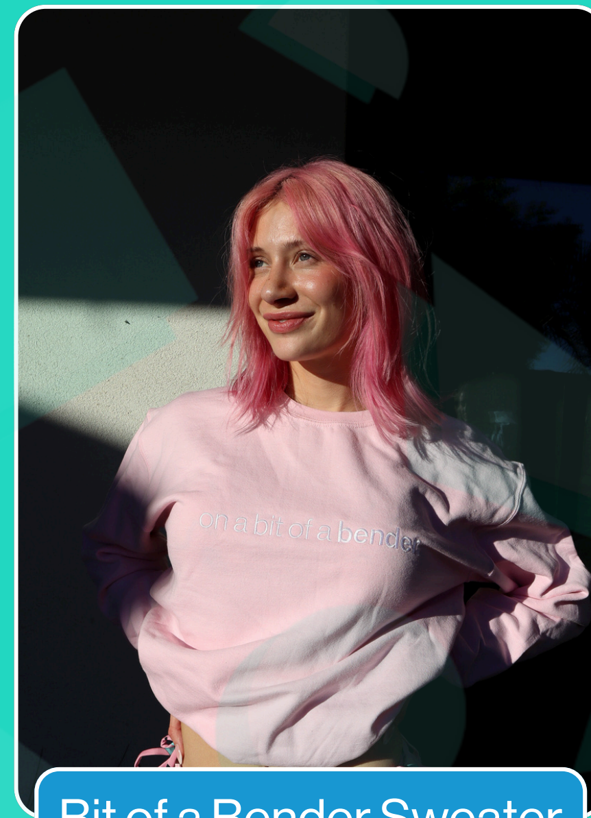
Bit of a Bender Sweater