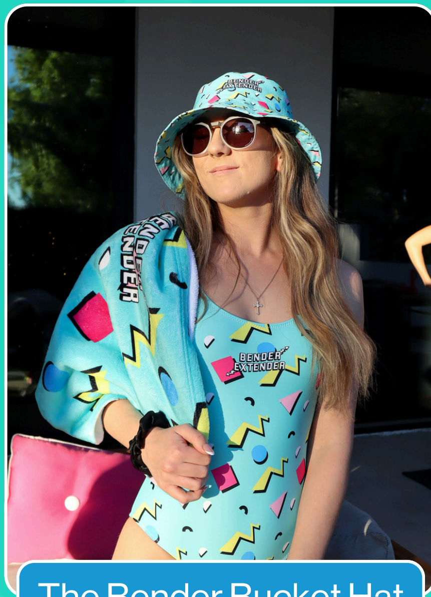
The Bender Bucket Hat